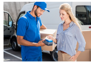
"Urgent shipment" entry flag on IRIS, available 24hr online