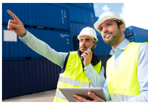
Priority Container allocation

Because some shipments are more urgent than others, GEODIS provides you with Priority Loading Service option to ensure your most critical shipment are given priority.