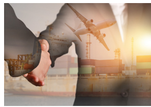
Guaranteed loading on planned vessel